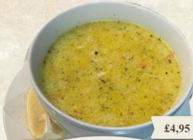
Summer Soup / tarator (served cold) yogurt soup with cucumber, dill, garlic and walnuts