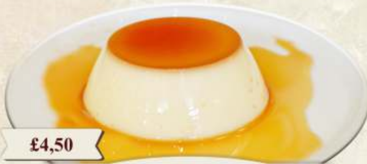
Cream Caramel (flan) (custard dessert with a layer of a soft caramel on top)