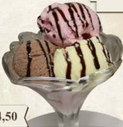
Mixed Ice Cream