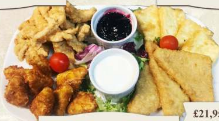
Breaded yellow cheese