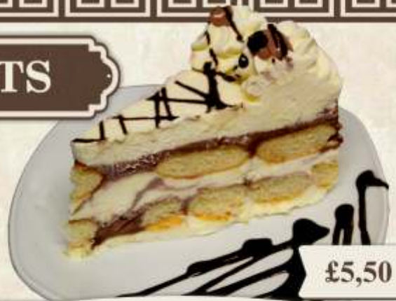
Ice cream cake